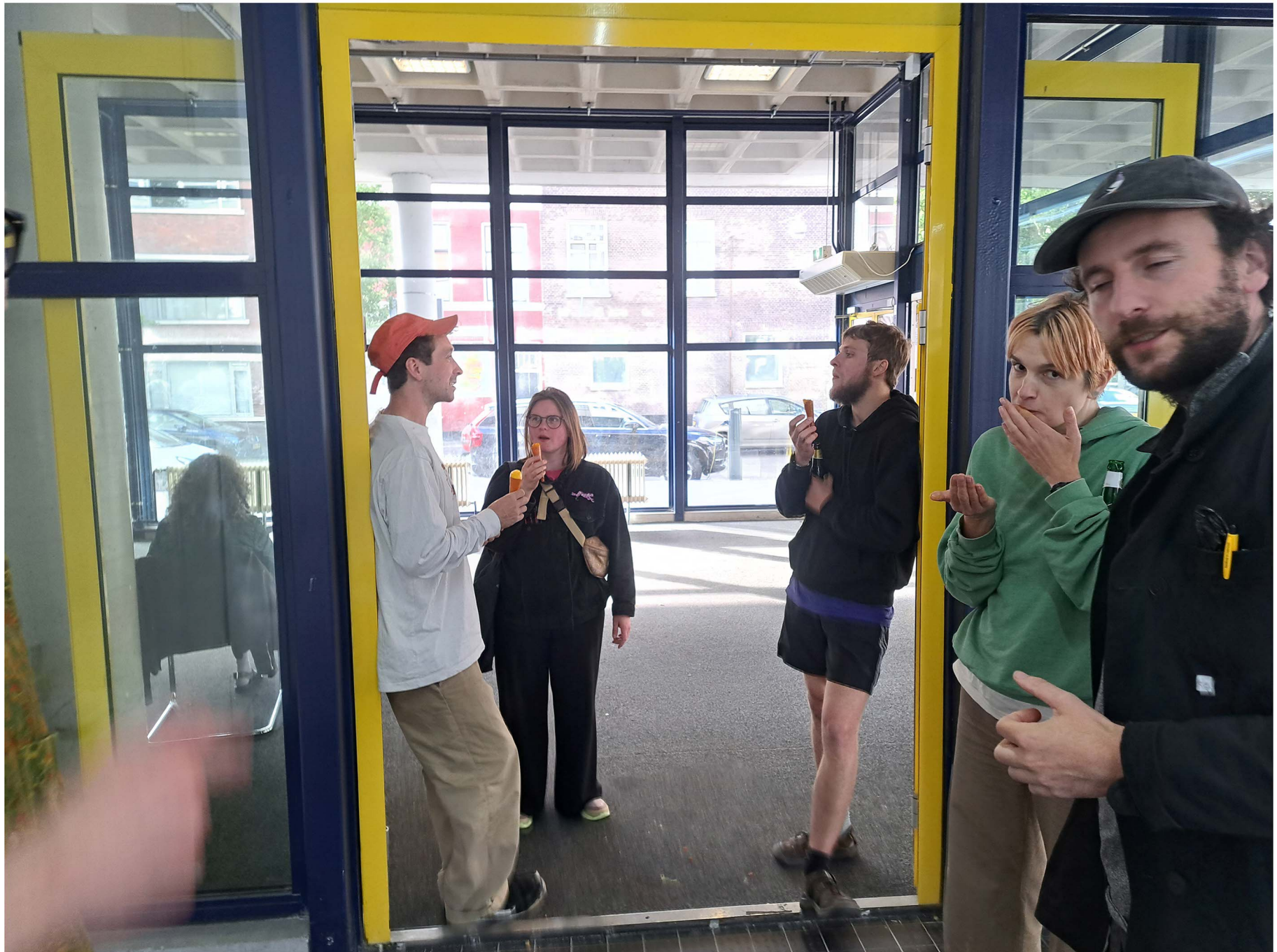
59. soap (bad acting or the art of destringing pigeons), 2024 installation view Billytown, The Hague