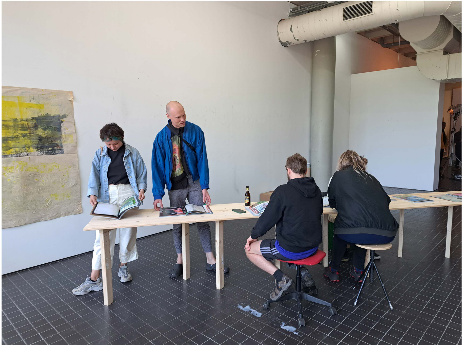
59. soap (bad acting or the art of destringing pigeons), 2024 installation view Billytown, The Hague