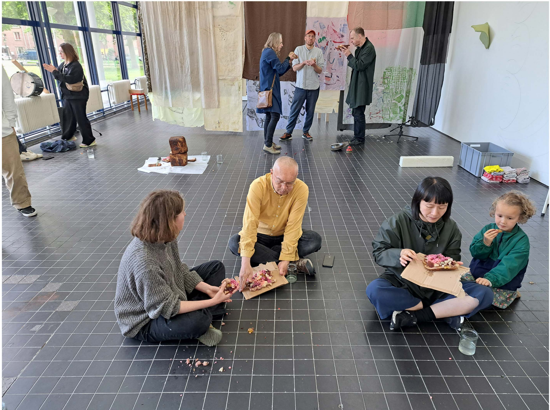
59. soap (bad acting or the art of destringing pigeons), 2024 installation view Billytown, The Hague