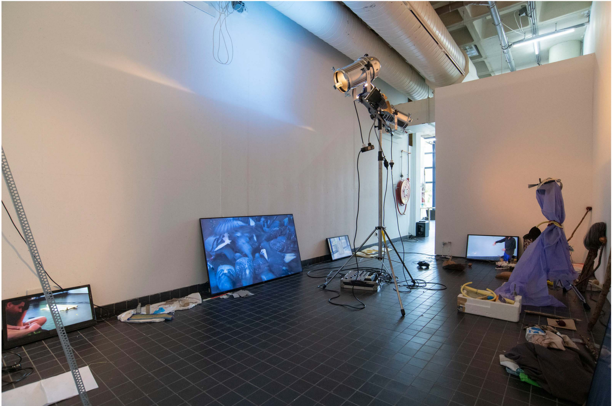
59. soap (bad acting or the art of destringing pigeons), 2024 installation view Billytown, The Hague