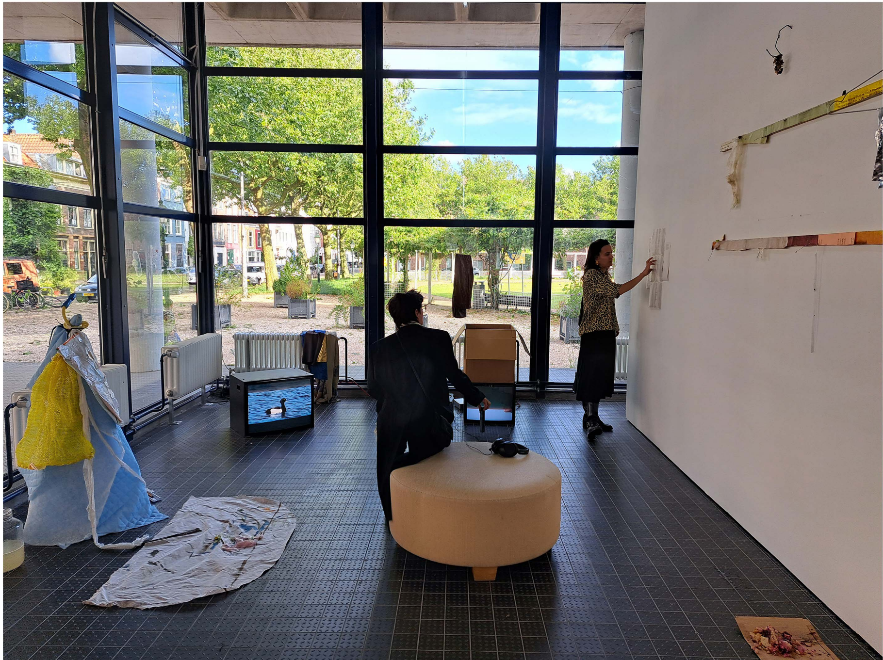
59. soap (bad acting or the art of destringing pigeons), 2024 installation view Billytown, The Hague