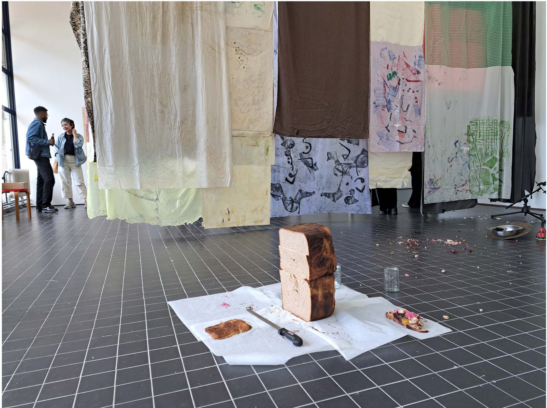
59. soap (bad acting or the art of destringing pigeons), 2024 installation view Billytown, The Hague