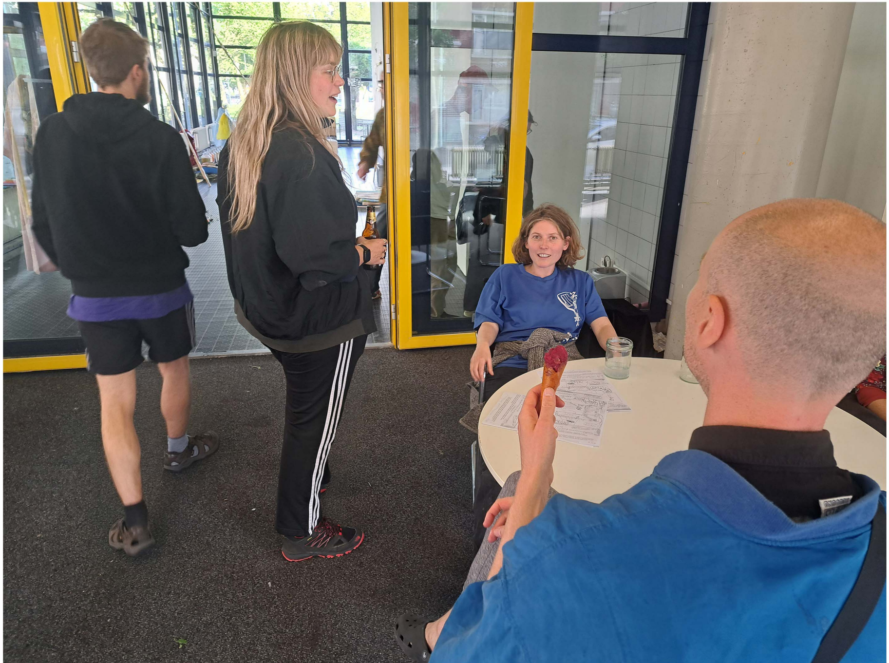
59. soap (bad acting or the art of destringing pigeons), 2024 installation view Billytown, The Hague