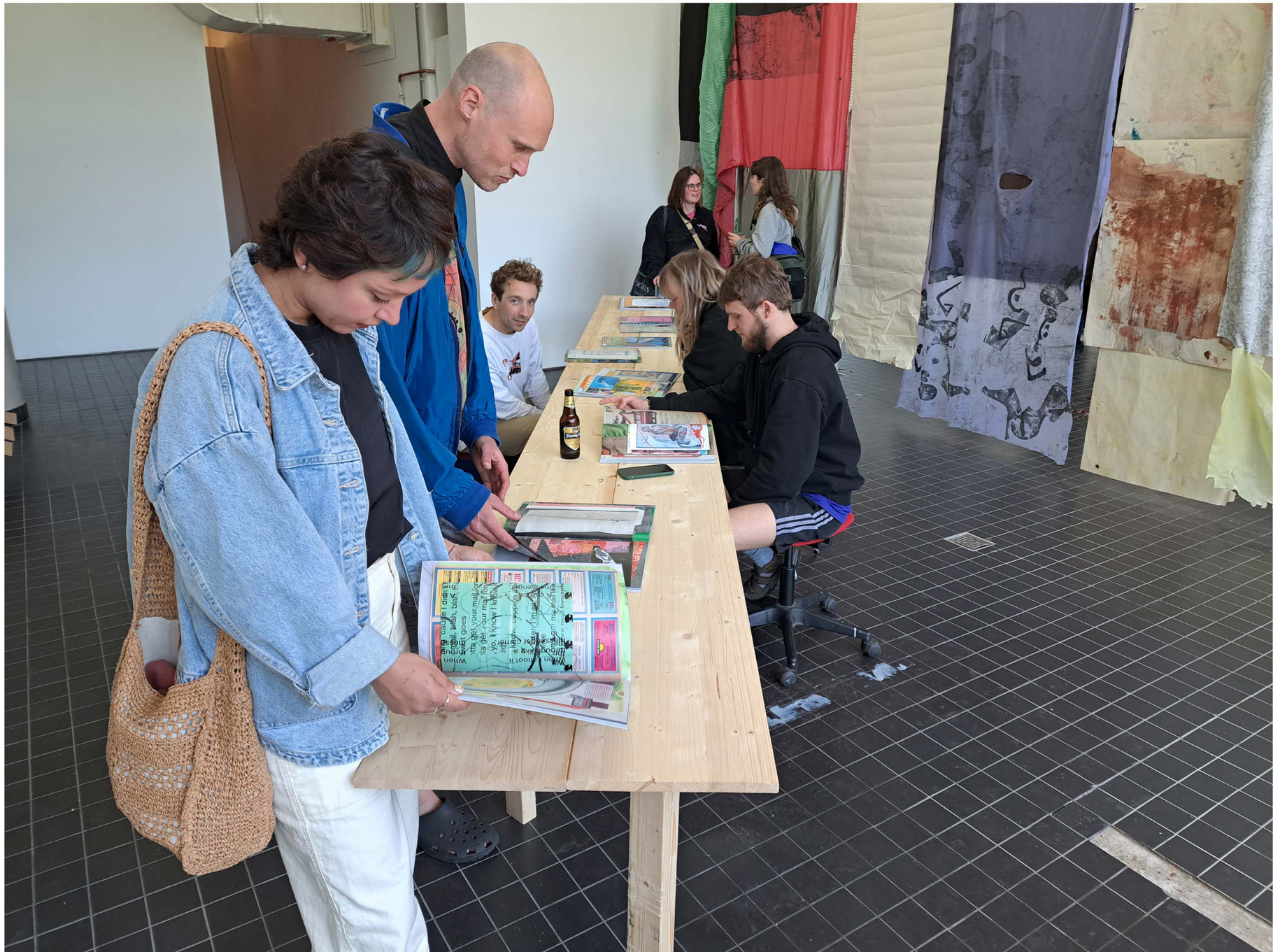
59. soap (bad acting or the art of destringing pigeons), 2024 installation view Billytown, The Hague