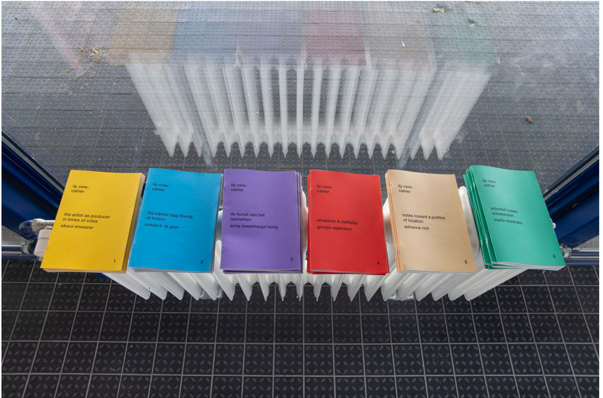
59. soap (bad acting or the art of destringing pigeons), 2024 installation view Billytown, The Hague