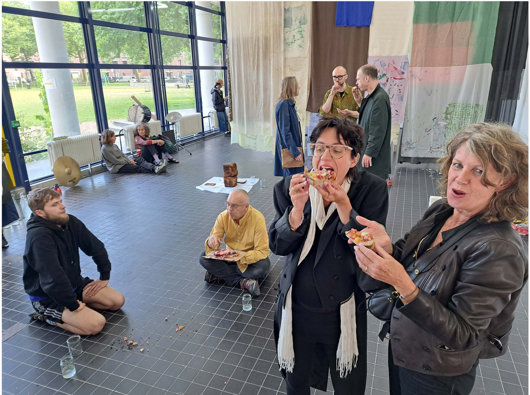
59. soap (bad acting or the art of destringing pigeons), 2024 installation view Billytown, The Hague