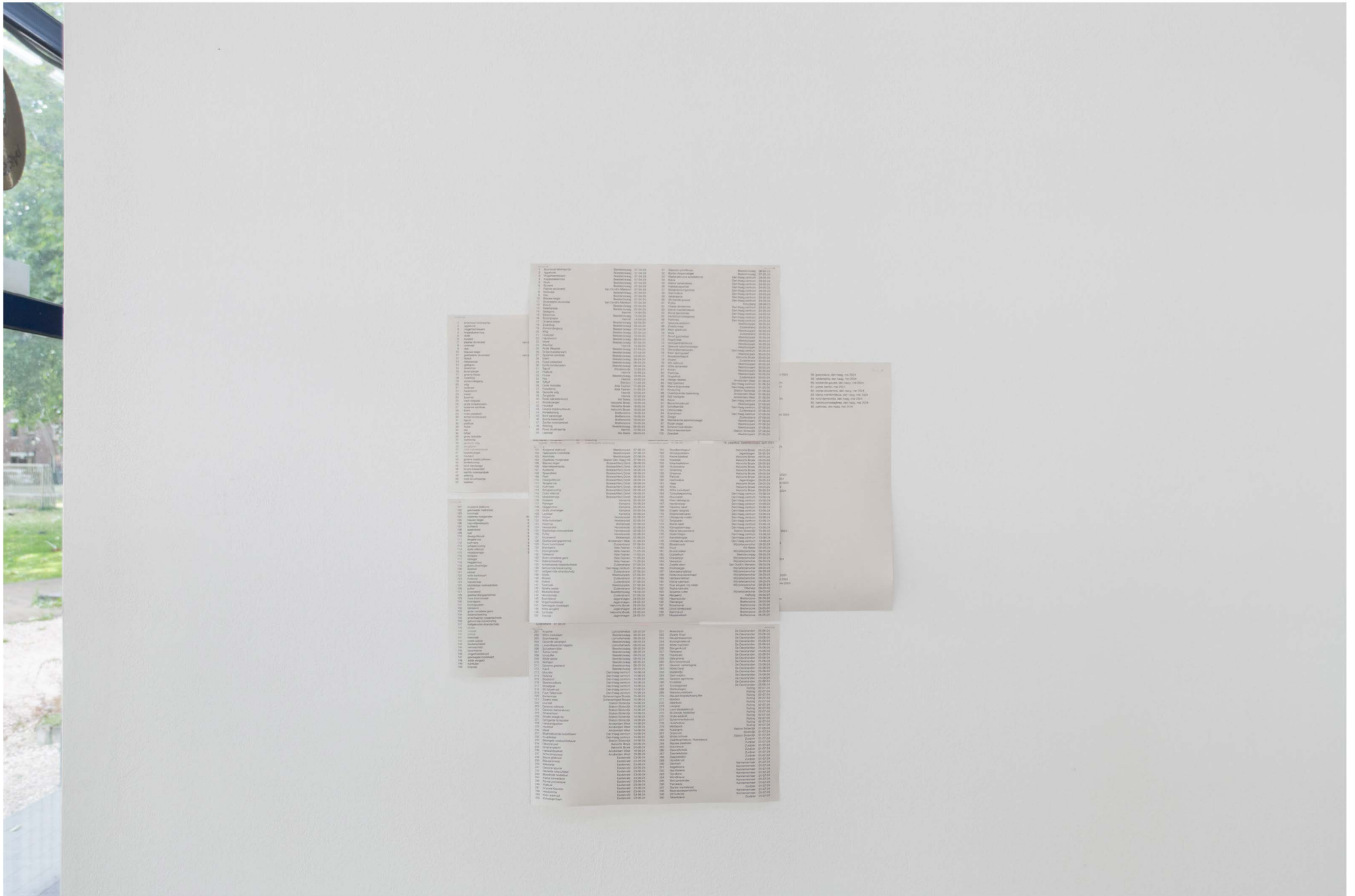
59. soap (bad acting or the art of destringing pigeons), 2024 installation view Billytown, The Hague