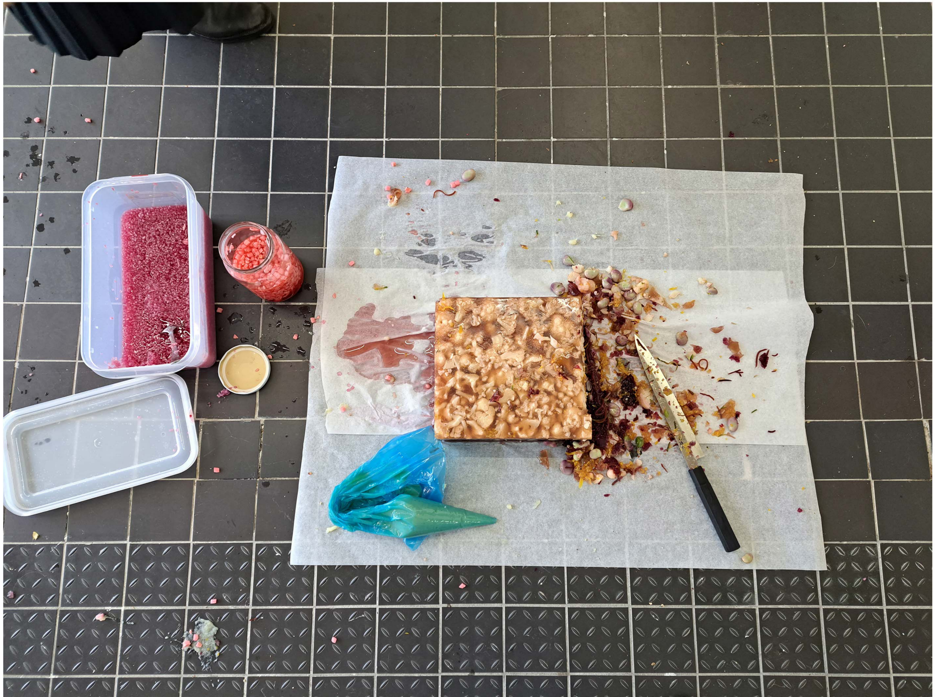
59. soap (bad acting or the art of destringing pigeons), 2024 installation view Billytown, The Hague