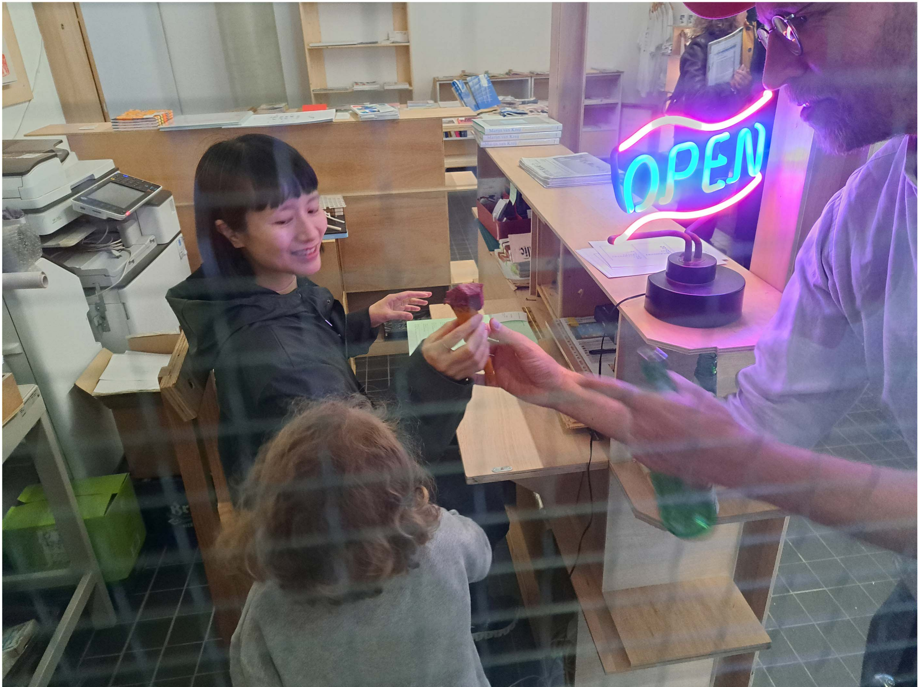
59. soap (bad acting or the art of destringing pigeons), 2024 installation view Billytown, The Hague