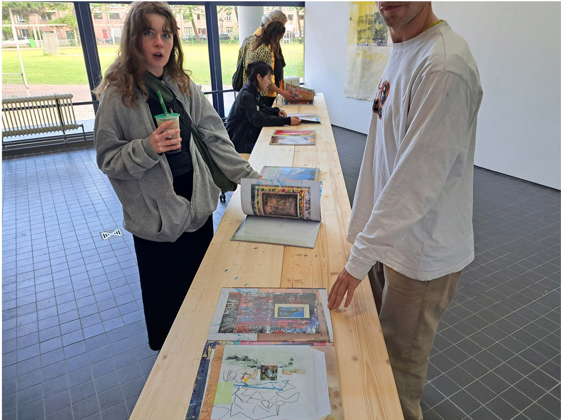
59. soap (bad acting or the art of destringing pigeons), 2024 installation view Billytown, The Hague