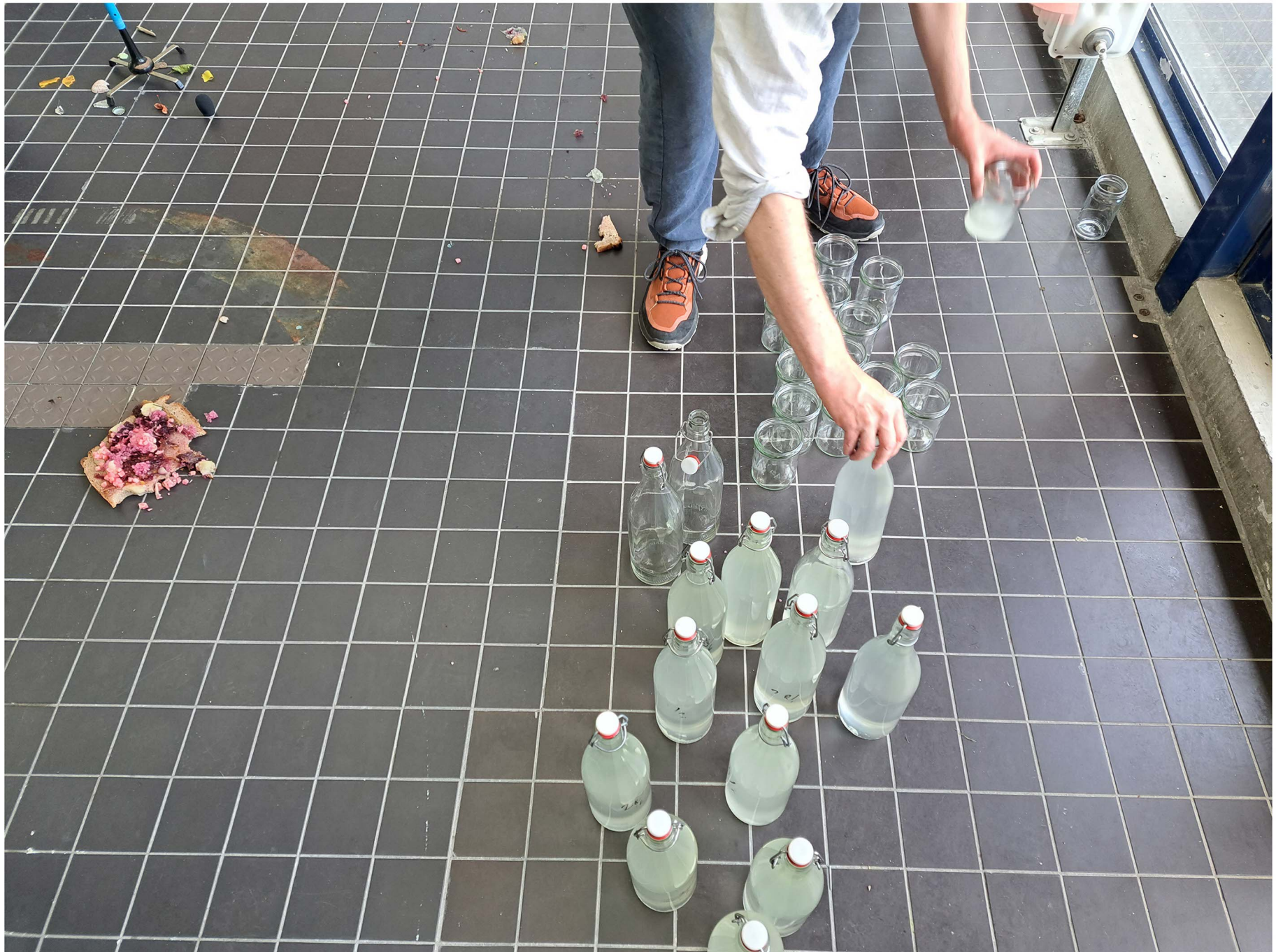
59. soap (bad acting or the art of destringing pigeons), 2024 installation view Billytown, The Hague