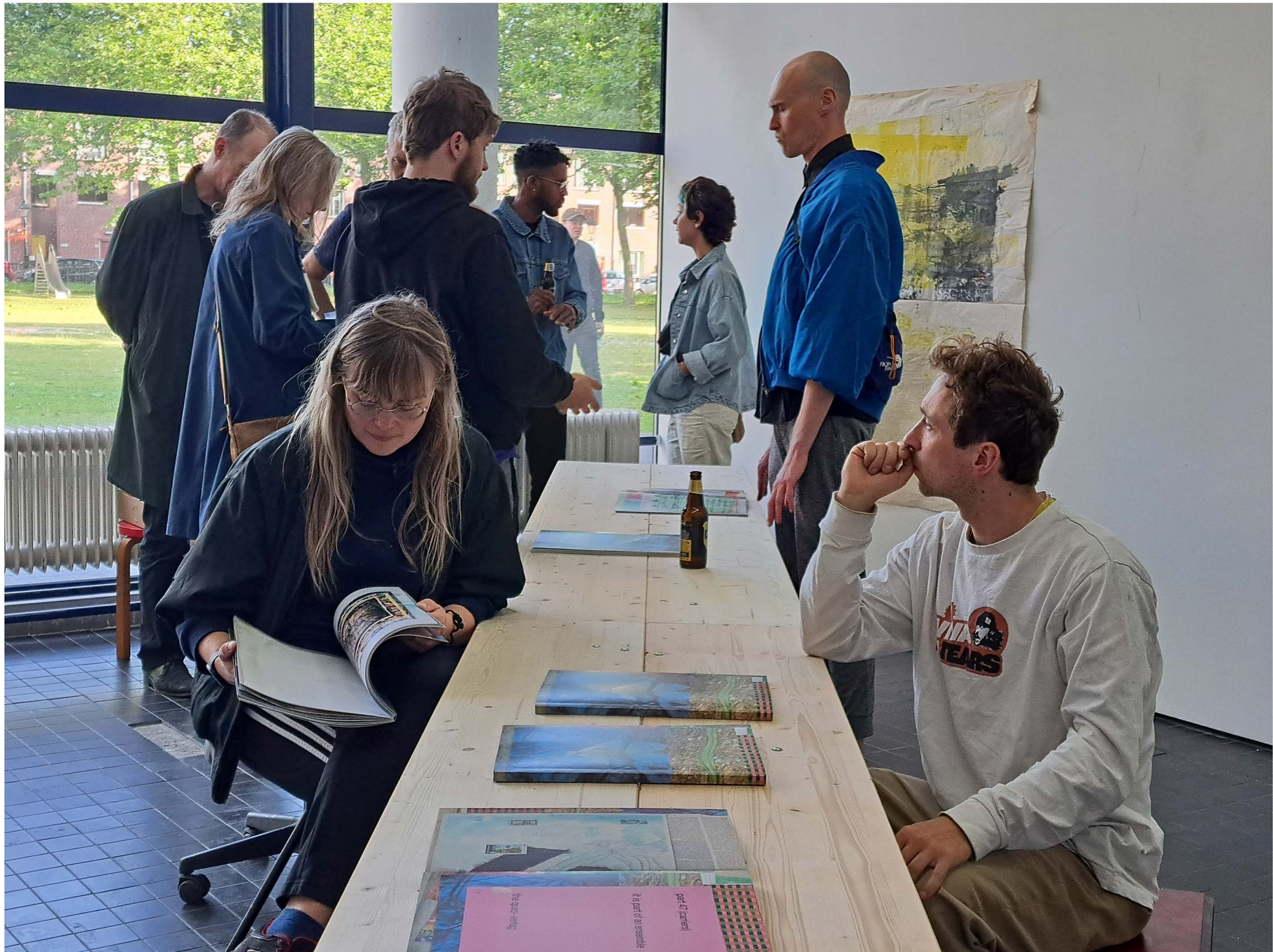
59. soap (bad acting or the art of destringing pigeons), 2024 installation view Billytown, The Hague